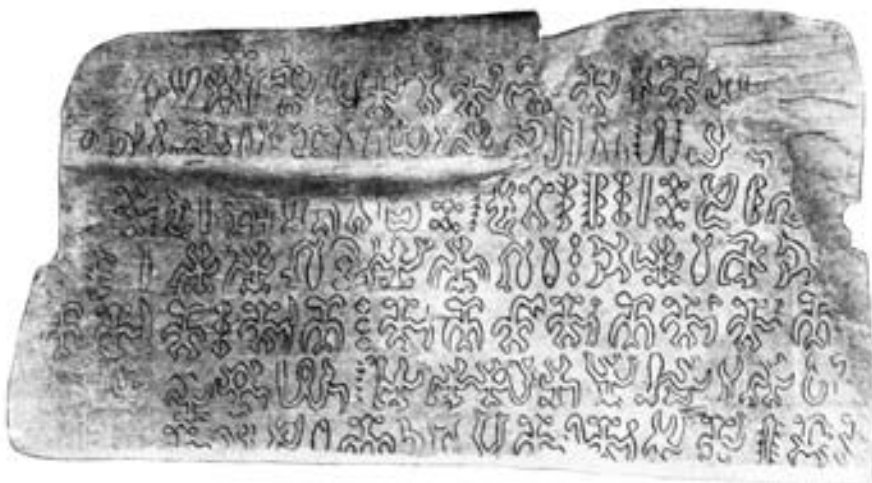
Figure 1. Rongorongo tablet. (Photograph from: William J. Thomson, "Te Pito Te Henua, or Easter Island," Report of the U.S. National Museum, Under the Direction of the Smithsonian Institution, for the Year Ending June 30, 1889, 1891, 447-552, plate XLII.)

Today lightning is a relatively minor weather phenom-