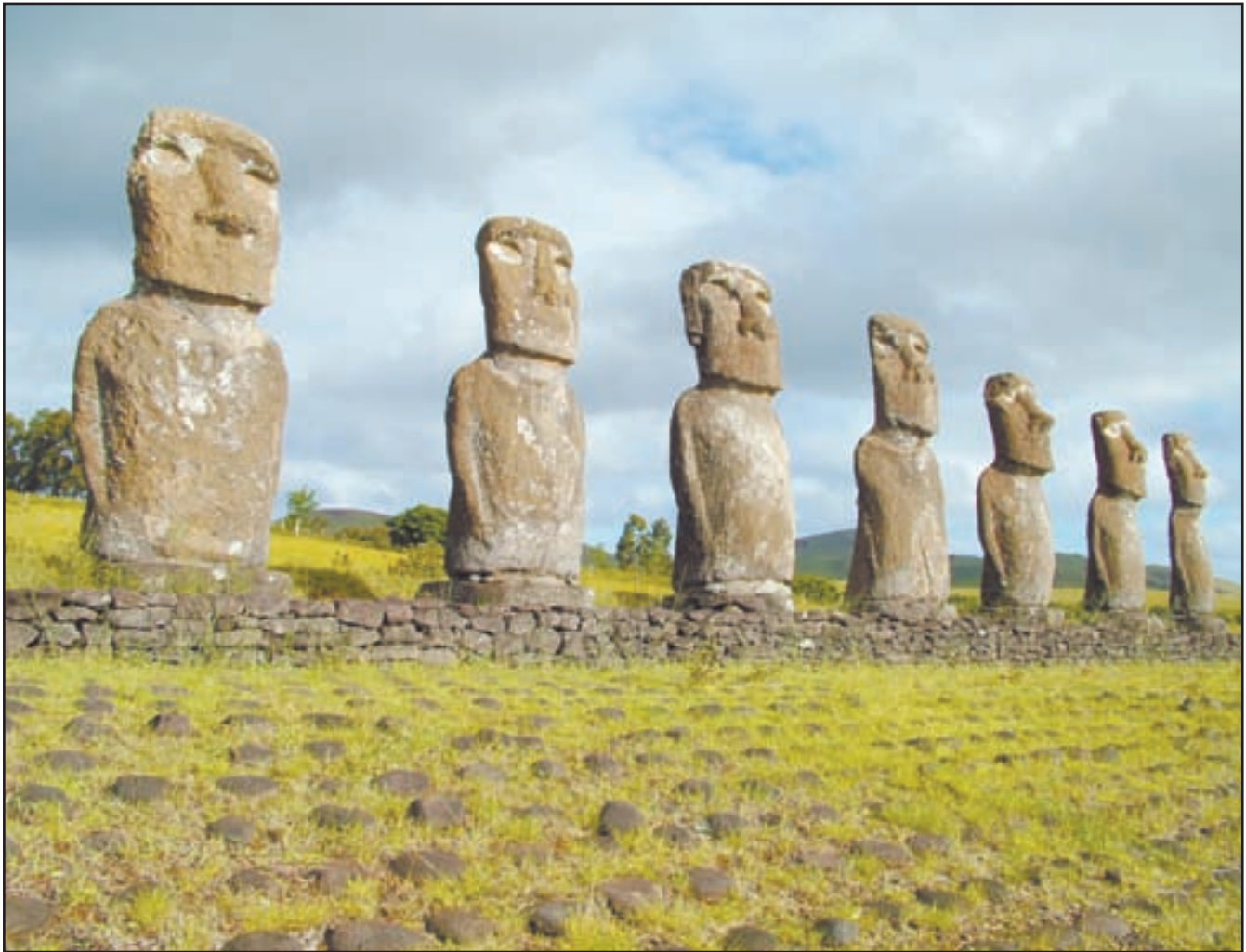
Easter Island moai.

enon, and the aurora are little more than pretty lights in the sky, offering no threat to the inhabitants on Earth, but I do not believe this was always the case. In particular, our Sun is not as stable as most generally believe. It undergoes relatively regular small-scale variations, such as the 11-year sunspot cycle, as well as longer-term patterns (perhaps on the order of millennia and more). Presently unpredictable instabilities of the Sun can result in mass ejections of plasma (solar storms) that may reach Earth with far-ranging consequences. An 1859 solar storm, the Carrington Event, though relatively tame from a geological perspective, resulted in unusual aurora seen around the world. Additionally, telegraph systems failed. If an equivalent solar storm hit today, possibly our modern electrical grids and communication systems would be devastated with untold consequences. Arguably, the Carrington Event was minor compared to other past events.