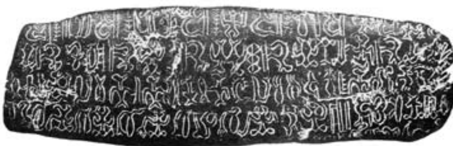
Figure 2. Rongorongo tablet.